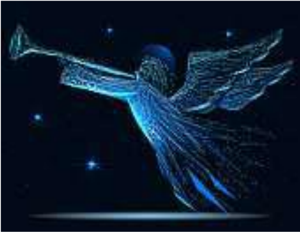
The Lord Himself is our first and greatest gift. Rejoice in the Lord Always.