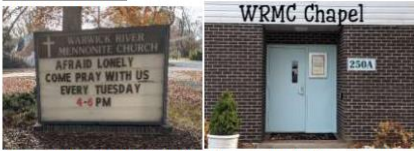
You are welcome to stop in briefly or for an extended time of prayer... To pray alone, with one other person, or a group of people. Prayer replenishes the soul. All are welcome!!