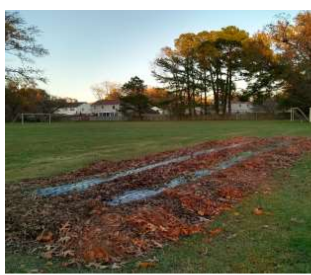
WRCLC / WRCS Future cutting garden for the children planted November 2020

November 29 Mel Shenk November 30 Louise Kraus