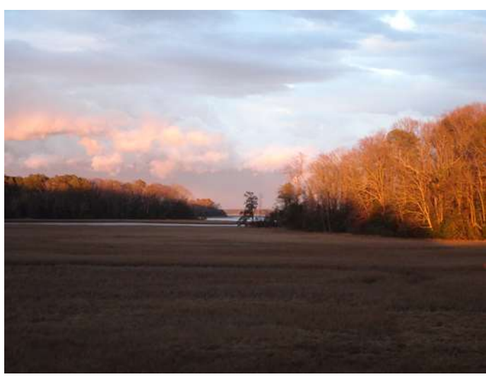
(*Those who are able may stand.)